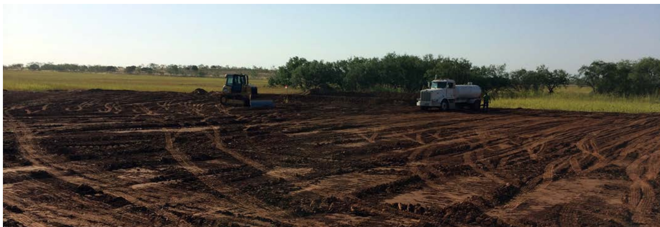
Site preparation on the Hopes-Boles PU #1 well

Pryme Energy Limited (Pryme or the Company) is pleased to announce that drilling of the first two wells in its Capitola Oil Project is scheduled to begin mid-September. Drilling permits have been lodged with the State of Texas and site construction is underway. The first two well locations are in the southern part of the Sweetwater acreage block (see about Capitola Oil Project below) and will be drilled vertically through the Cline Shale at a depth of approximately 6,000 feet.