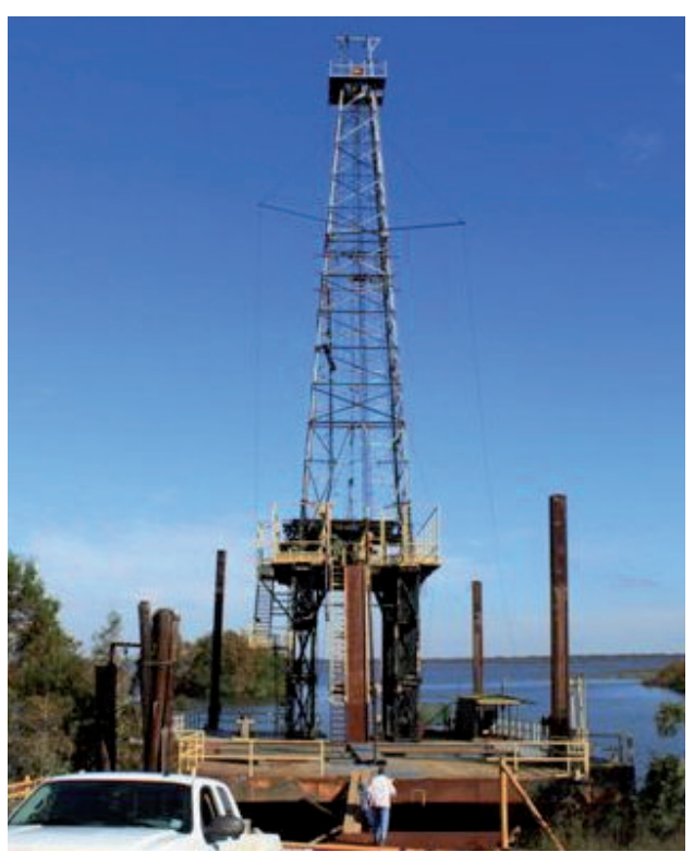
The barge rig used to drill wells on the Lake

Future Corporation Australia Limited (FUT) owns a 50% interest in PLX following a capital contribution of $700,000. FUT also agrees to pay Pryme an additional US$350,000 through a revenue sharing agreement over its share of PLX production.